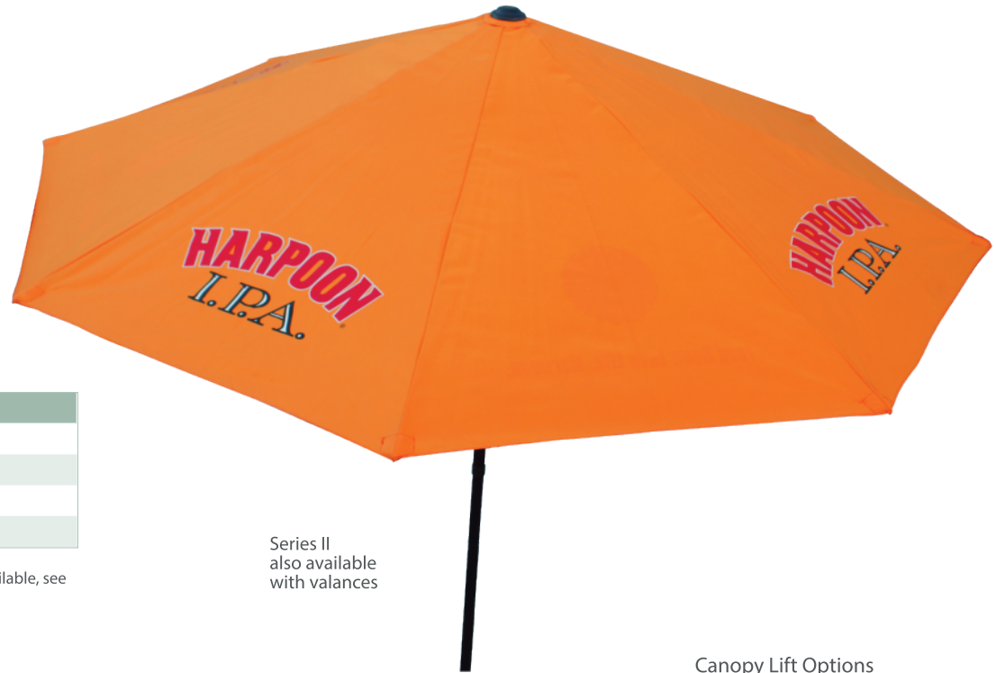
Series II also available with valances